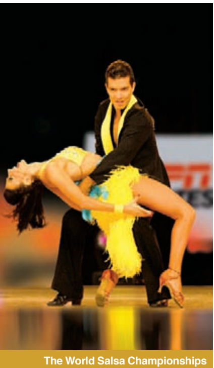
will be televised worldwide.