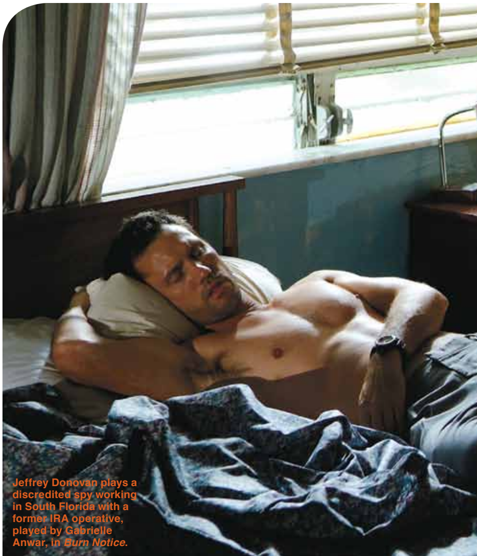
Jeffrey Donovan plays a discredited spy working in South Florida with a former IRA operative, played by Gabrielle Anwar, in Burn Notice .